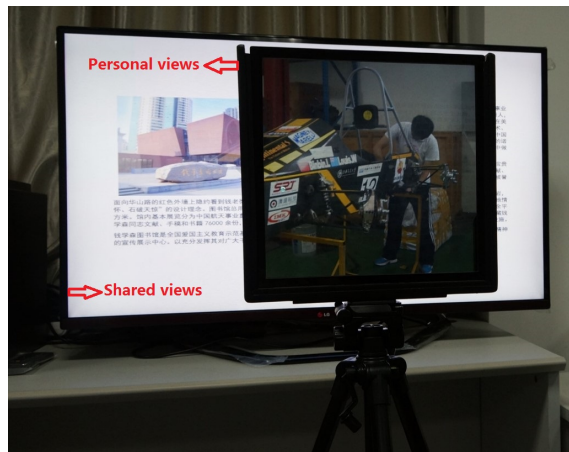
Fig. 1: The prototype system of the dual-view display. We denote the view through this polarization glasses or polarizing film as the personal views and the one watched directly from the screen as the shared views.

As a new display technology, Temporal Psychovisual Modulation (TPVM) was lately proposed by Wu and Zhai in [1], [2], [3] and [4], which aims to generate multiple percepts for different viewers on the same medium. In TPVM system, the viewers wearing different active liquid crystal (LC) glasses with varying transparency levels can see different images (called personal views ). The viewers without LC glasses can also see a semantically meaningful image (called shared views ). The idea of TPVM can be extended to spatial domain, called spatial psychovisual modulation (SPVM). The implementation of dual-view display (DVD) system is based on the SPVM. It is possible to devise a type of dual-view system on a single display using the mismatch between resolutions of modern display devices and the HVS. Modern display devices now support very high pixel density. Meanwhile the human visual system (HVS) cannot distinguish image signals with spatial frequency above a threshold, as predicted by the contrast sensitivity function (CSF). Therefore, a stereoscopic display device can be utilized in DVD system, odd and even scan lines of the device are polarized in different directions. The PPI of this type of screen is usually very high that HVS cannot discriminate the mismatch between the left and right eye image. It is possible for this type of display device to