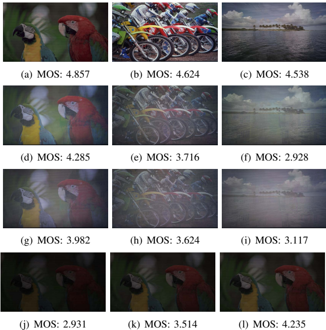
Fig. 4: Twelve images with resolutions of 1920 \times 1080 used in the DVD database. First row, the shared views with the full dynamic range in DVD system. Second row and third row, the shared views with different dynamic range degrees. Fourth row, the personal views with different dynamic range degrees in DVD system. Three columns are of different image complexity except the fourth row.

complexity distributes irregularly or unequally in the images, e.g. Fig. 4 (d),(e),(f),(g),(h) and (i). It should be pointed out that all the images in DVD database are generated when DVD system is running and the image resolution is 1920 \times 1080 .